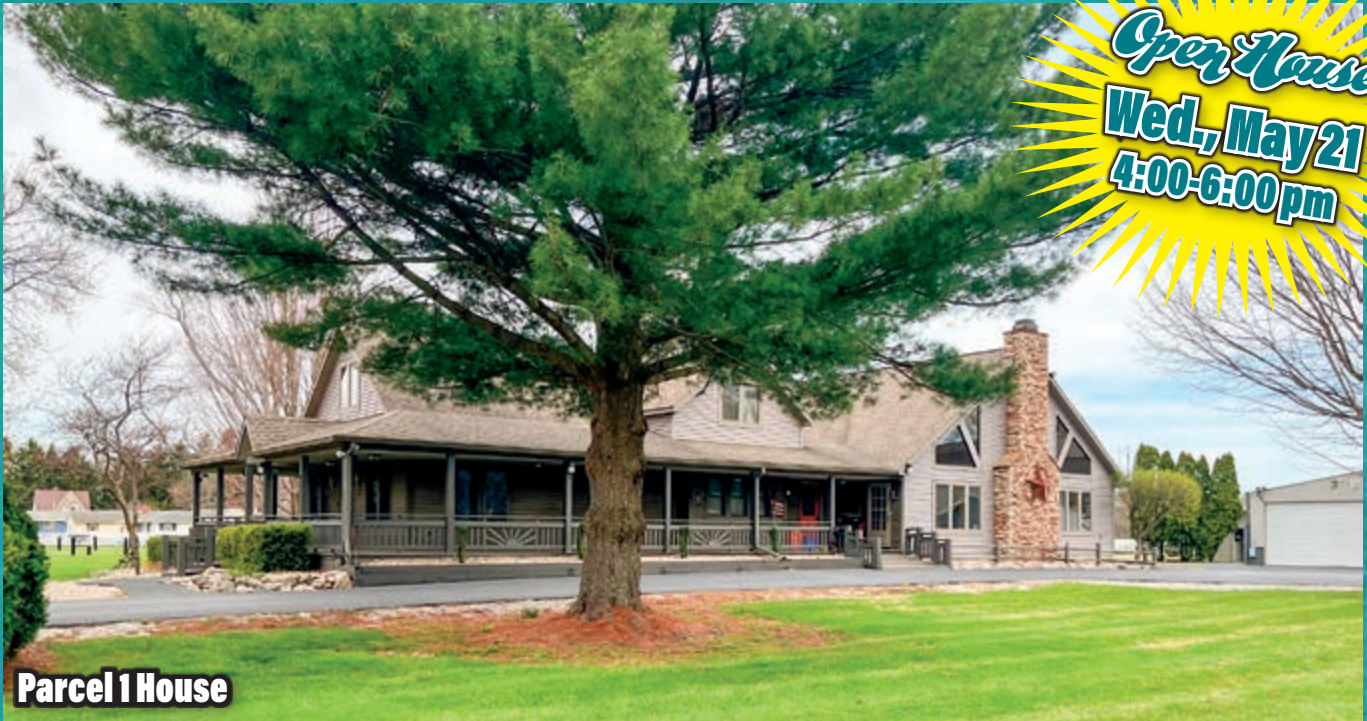
Parcel 1 House

All of the Properties touch at some point - Buy one or Multiple Parcels